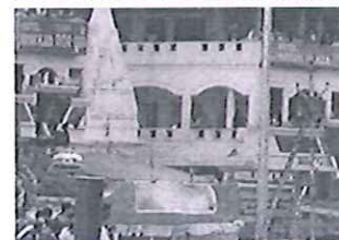
Fig 3 b