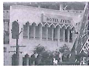
Fig 3 a