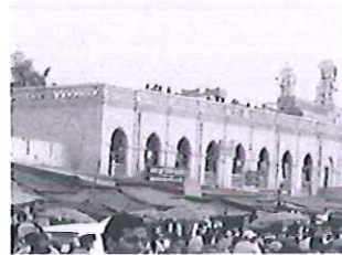
Fig 2 a