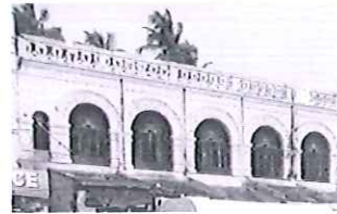
Fig 2 b