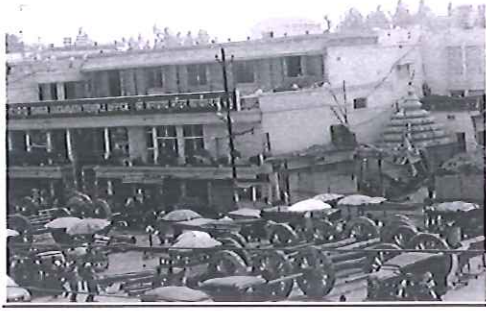
Fig 1 a